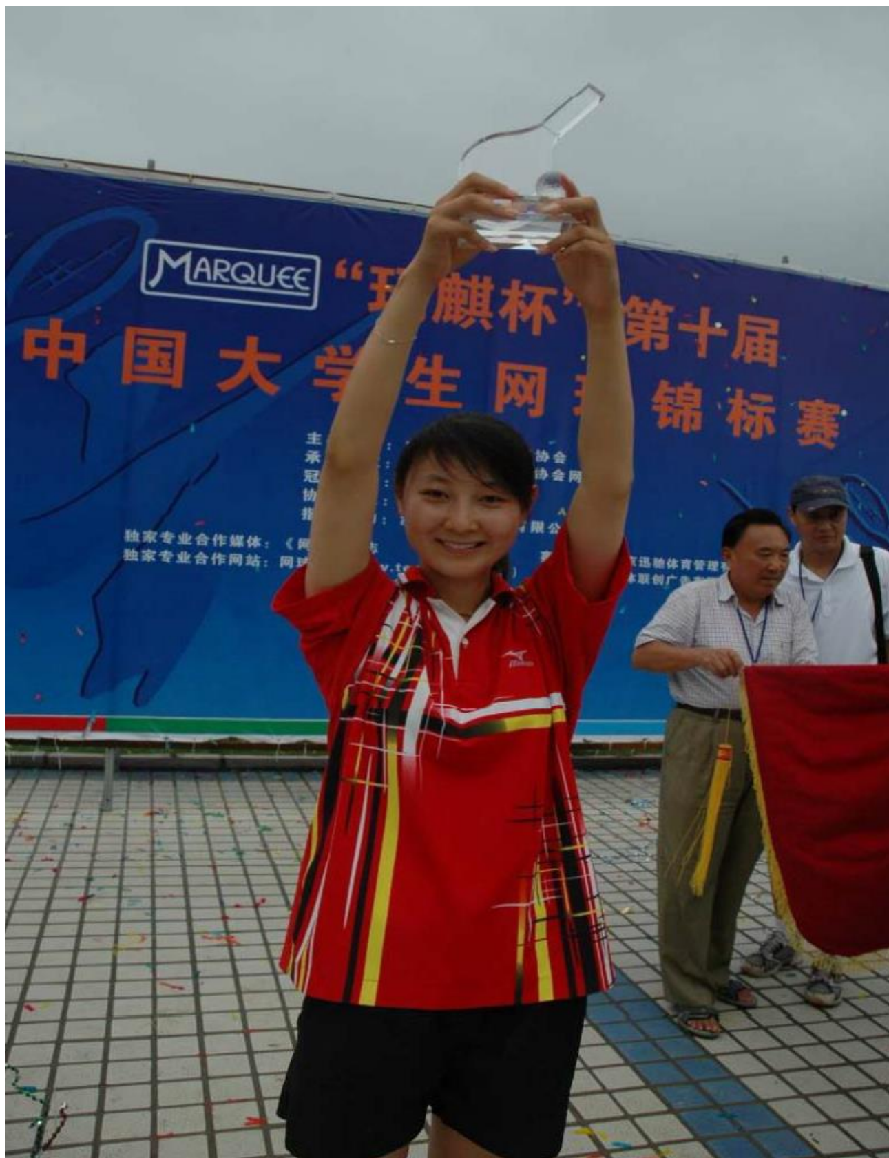
Marquee Corporation's National University Men's & Women's Tennis Championship – Awards Ceremony in China