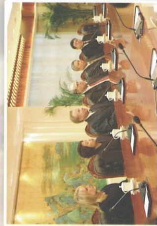
优秀的玛麒团队 Marquee Corporation Delegation