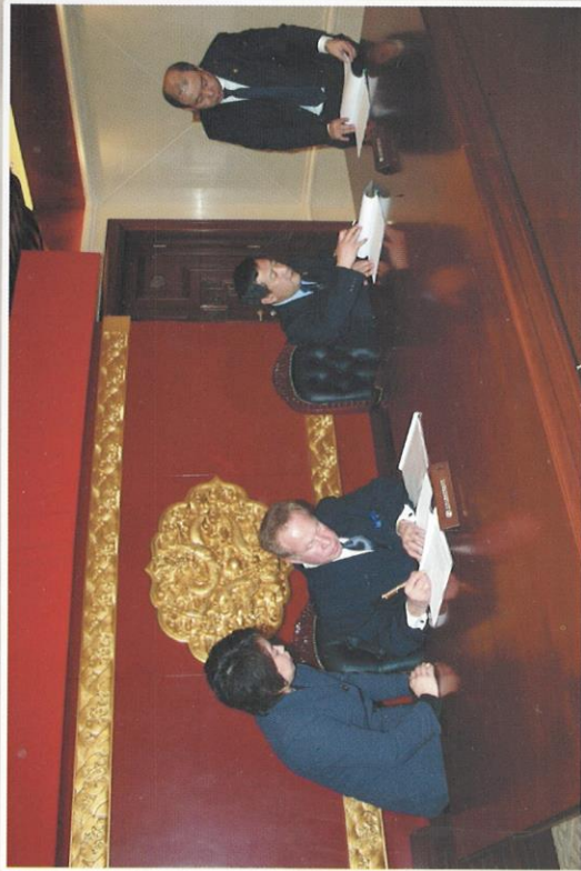
玛麒集团与中国大学生体育协会正式签约 Agreement Signing Ceremony Marquee Corporation and Federation of University Sports of China