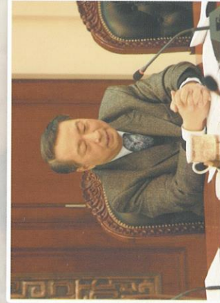
中国教育部副部长 章新胜 亲临指导 Mr. Zhang Xinsheng Deputy Minister, Ministry of Education People's Republic of China