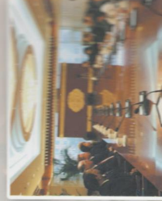
正式签署合作条约现场 The Official Signing Ceremony Marquee Corporation Delegation and Federation of University Sports of China Delegation